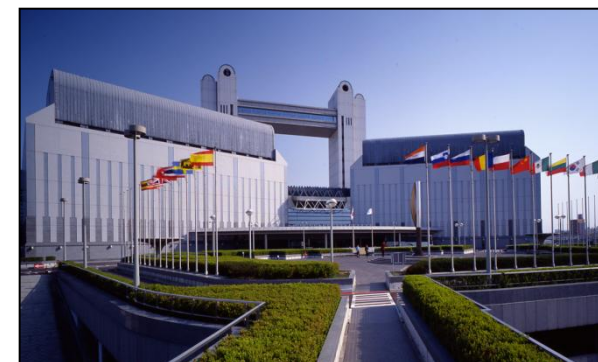
Nagoya Congress Center